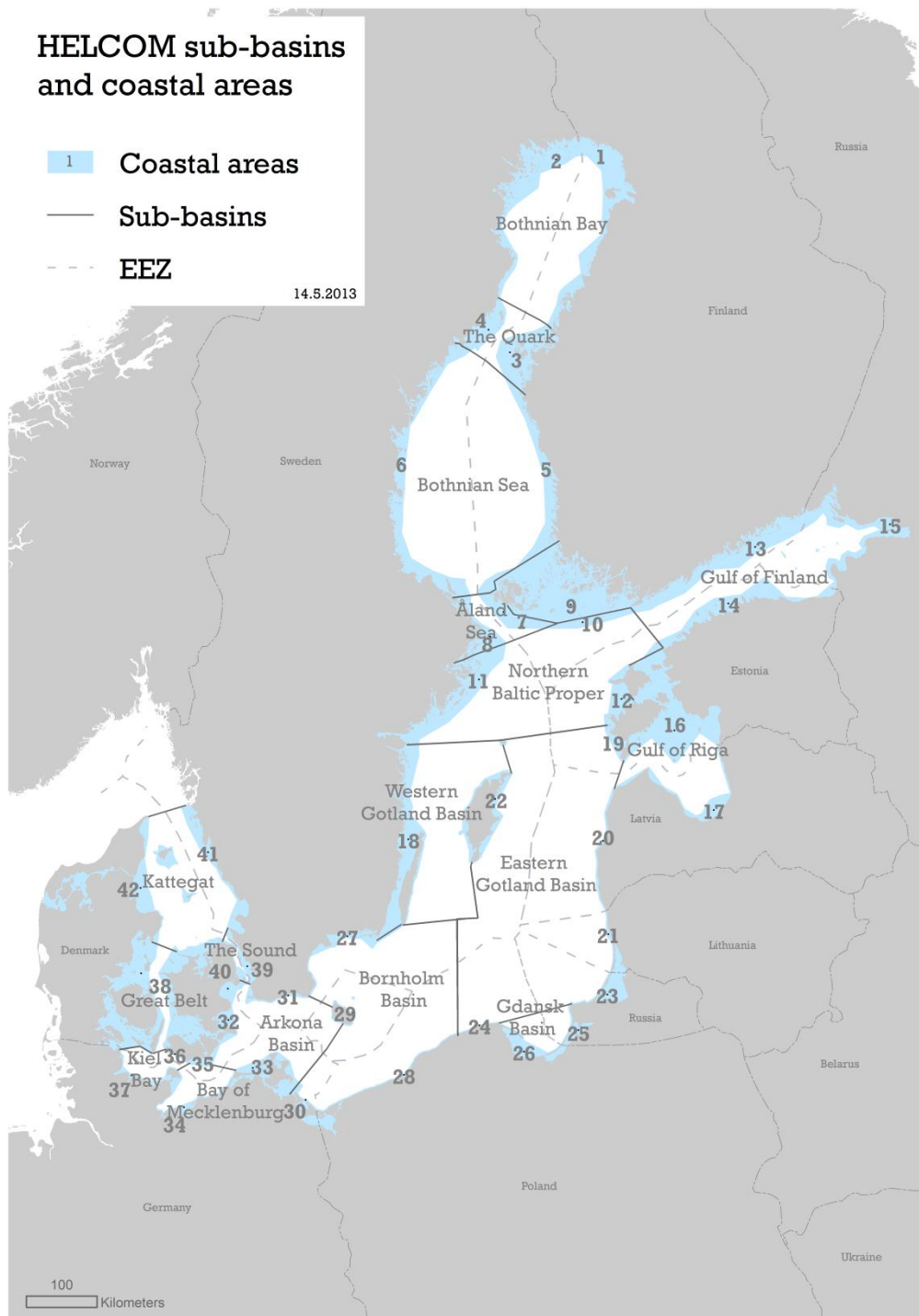
Figure 1. Map of the Baltic Sea presenting the HELCOM sub-division into 17 open sub-basins and 42 coastal areas. The names of the open sea areas and coastal areas are provided in Tables 1 and 2, respectively. EEZs of the countries are shown with a grey dashed line. 2