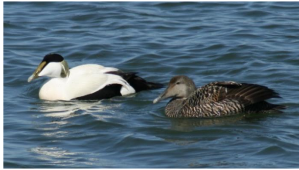
Somateria mollissima.