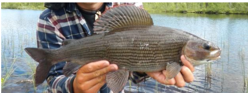
Grayling.